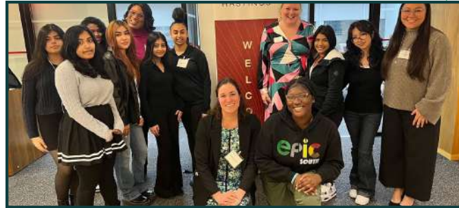
EPIC Students attend PENCIL's Women in Law Event held by the Paul Hastings Firm at the MetLife Building in Manhattan