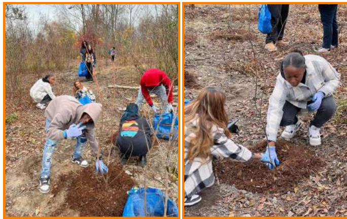
EPIC Students from MBK and MSK planting trees in Alley Pond Park in Queens, NY

EPIC Debate Team - Cheerleading - Boys Basketball Team (PSAL) - Girls Basketball Team (PSAL) - Girls Volleyball (PSAL) - Indoor Track & Field (PSAL) - Dance - Music Creation - Podcast & Recording Studio - My Brother's Keeper (MBK) - My Sister's Keeper (MSK) - Leadership Training Program - EPIC Advocacy Team